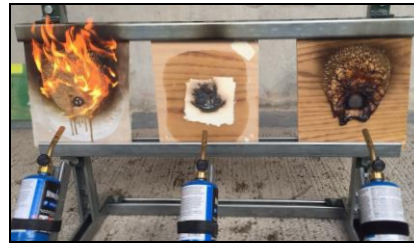
Testing fire resiliency of industry fixatives/intumescent coatings