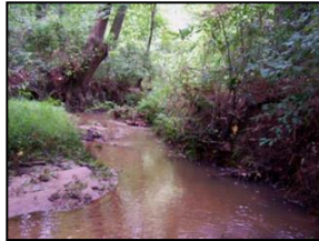
ARC soil/groundwater analytical laboratory, & Tims Branch