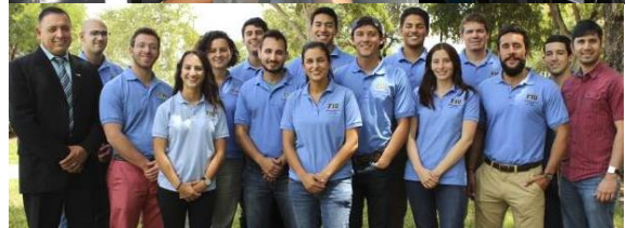
Summer 2015 interns