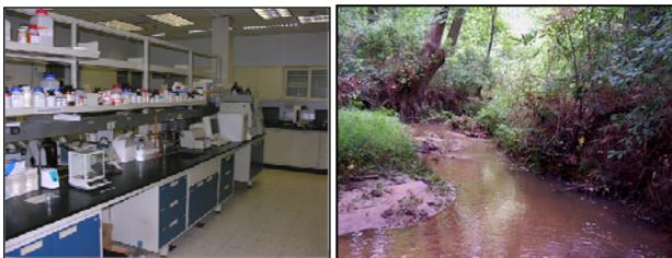
ARC soil/groundwater analytical laboratory, & Tims Branch