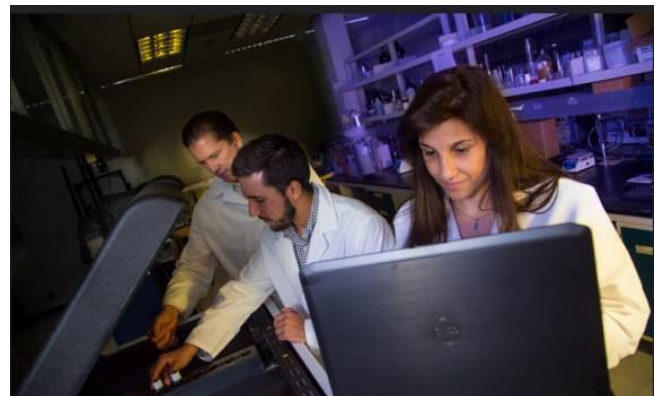
DOE Fellows and mentor conducting research in the ARC Radiological Laboratory