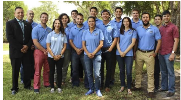
DOE Fellows participated in summer 2015 student internships