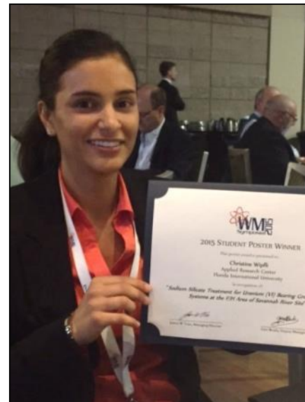
DOE Fellow (Winner of Best Student Poster) at WM15