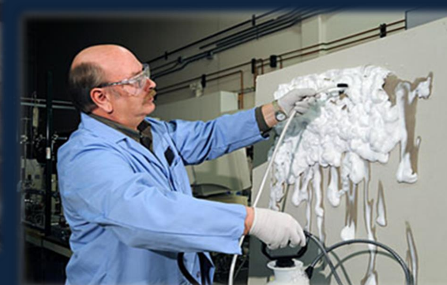
Foam and Paste (Rad-Release)