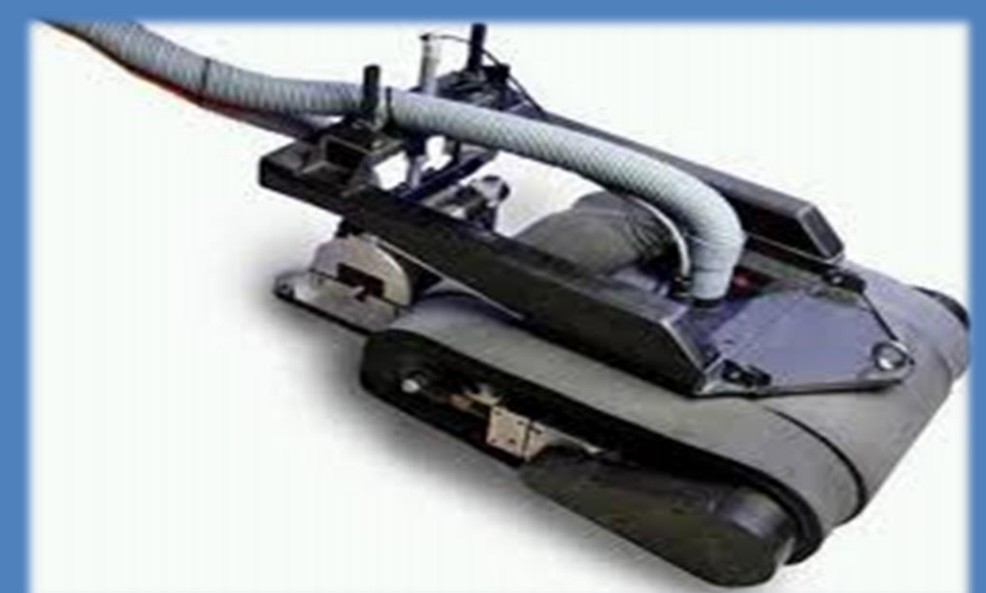
International Climbing Machine (ICM)

The Radiological Lab at the Applied Research Center is equipped with state-of-the-art glove boxes, a three-stage HEPA+activated charcoal filtration system, a fume hood, and a lead brick shielded enclosure for conducting studies on any material emitting alpha, beta, or gamma radiation.