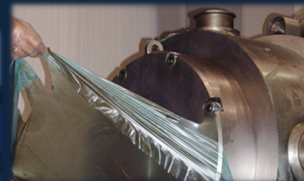
Peelable Gel (Decon Gel)