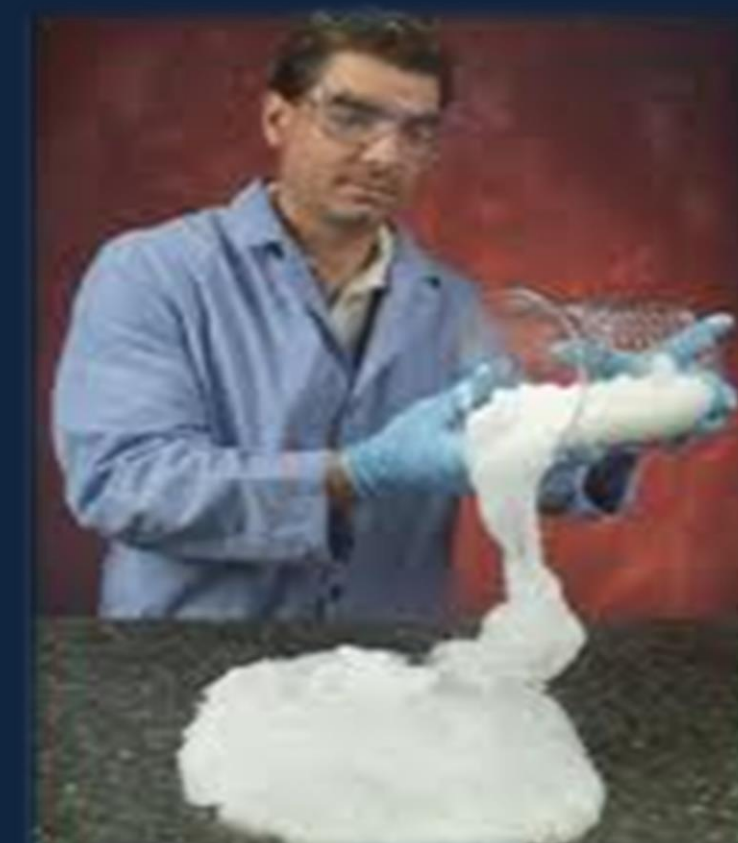
Absorbent Gel (Argonne Supergel)