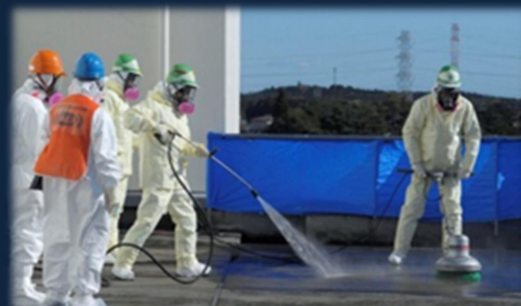
Scrubbing Solution (Quick Decon RDS)