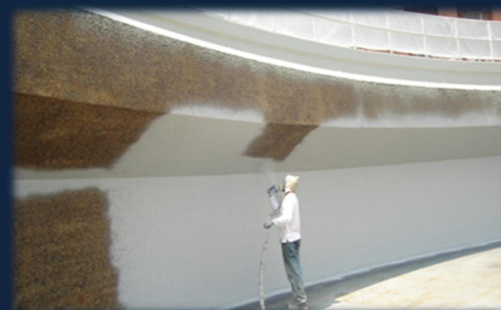
Fixative/Paint (Envirolastic AR 425- Sherwin Williams)